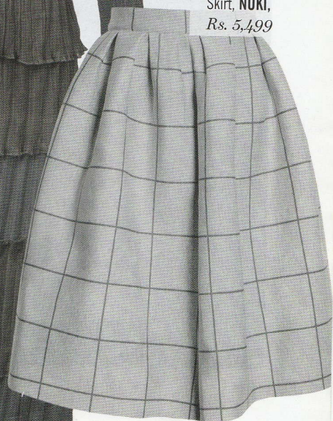
Skirt, NUKI , Rs. 5,499