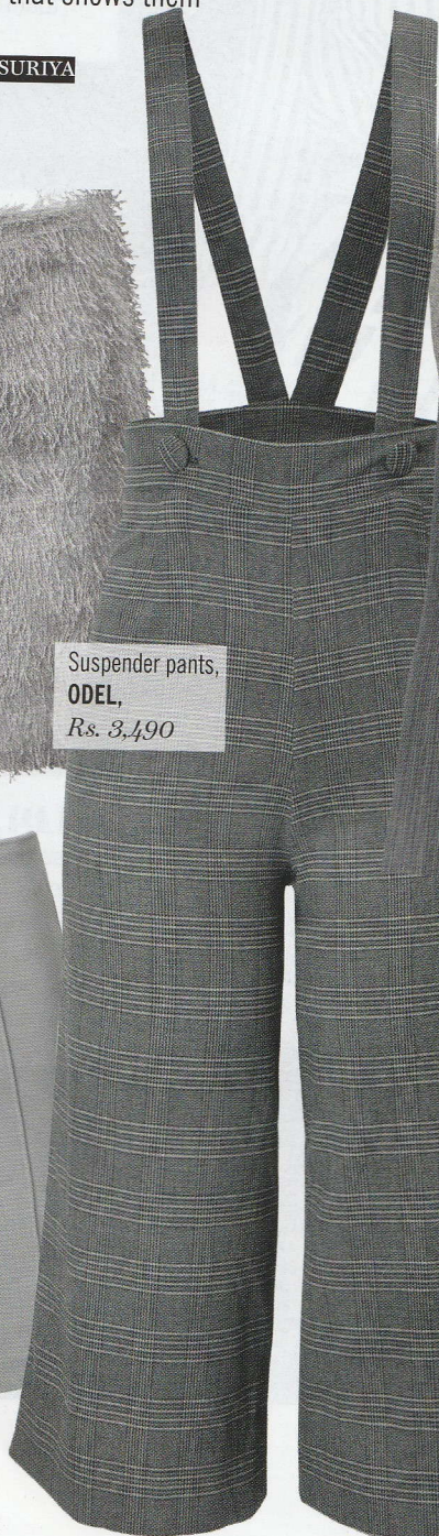
Suspender pants, ODEL , Rs. 3,490