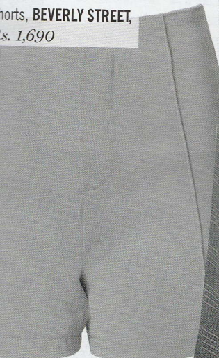
Shorts, BEVERLY STREET , Rs. 1,690