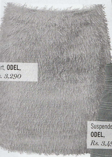
Art, ODEL , Rs. 3,290