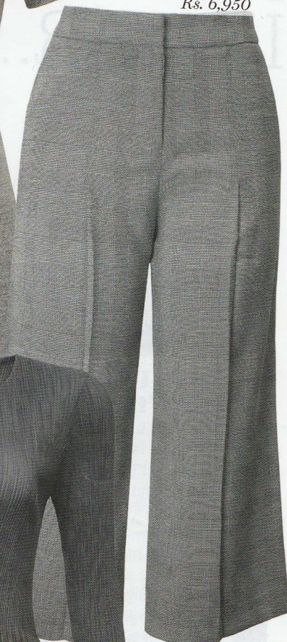
Culottes, SPLASH , Rs. 6,950