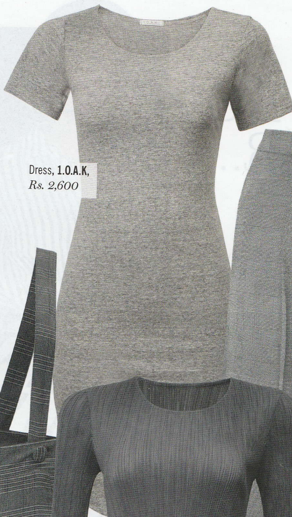
Dress, 1.O.A.K. , Rs. 2,600