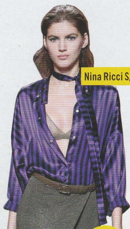
Nina Ricci S/S 17

SAY IT WITH SILK This season's cool silk drapes tease your curves and add timeless glamour to any outfit. Bright blouses – like ODEL's peephole halter – are perfect for a mid-day coffee hang. Take a cue from Nina Ricci and add silk shirts to your office wardrobe; loosen up your buttons, baby, and roll up your sleeves to make it NSFW in one hot moment!