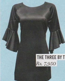
THE THREE BY TPV, Rs. 7,950