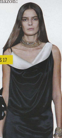
Lanvin S/S 17

Add a tropical touch with floral prints from Mango or don a Miu Miu midi with a sweetheart neckline and midriff cutout for a toned treat; pair both pieces with platforms to be ahead of the silken curve. Pick a midnight, bell-sleeved mini from The Three By TPV to ooze effortless evening chill, or turn to Lanvin's maxis for a lengthy silhouette that screams, "Glamazon!"