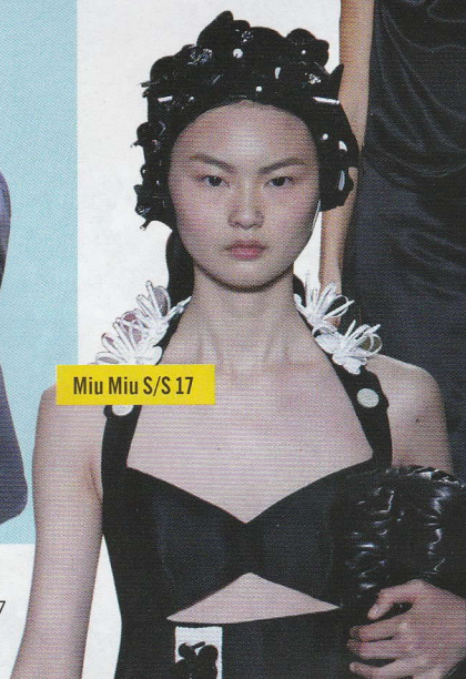
Miu Miu S/S 17